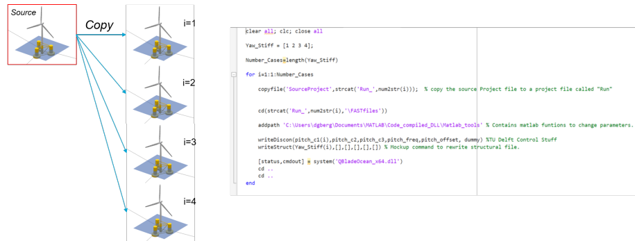
Figure 1: Graphical representation of the desired workflow using QBlade as .dll within Matlab. The Matlab code included is only for illustrative purposes.

Figure 1 shows a graphical representation of the desired workflow. The main idea depicted is that you begin with a baseline set-up (In this case a floating wind turbine) and copy that whilst altering some properties of the system. The Matlab code is only added for illustrative purposes. Chapter 4 will have examples of working Matlab code for common wind turbine simulation cases.