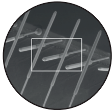
1. Nanowire growth (TU Eindhoven)