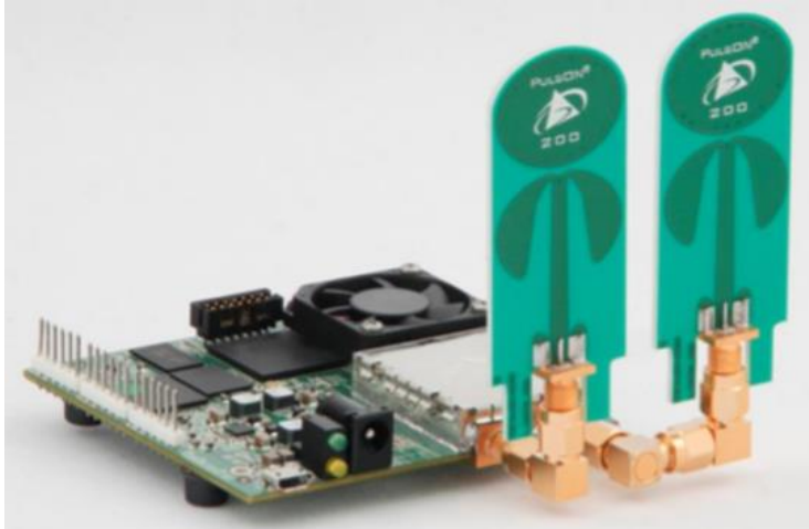
Figure 2: The PulsON P410 - Time Domain (Humatics) radar.