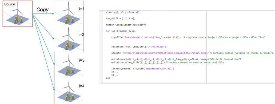
Figure 1: Graphical representation of the desired workflow using QBlade as .dll within Matlab. The Matlab code included is only for illustrative purposes.