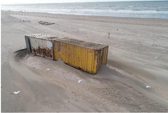
Figure 3: The full-size model of experiment B

The bed around scale models is measured using structure-from motion (SfM) photogrammetry at two moments in time to measure morphological development.